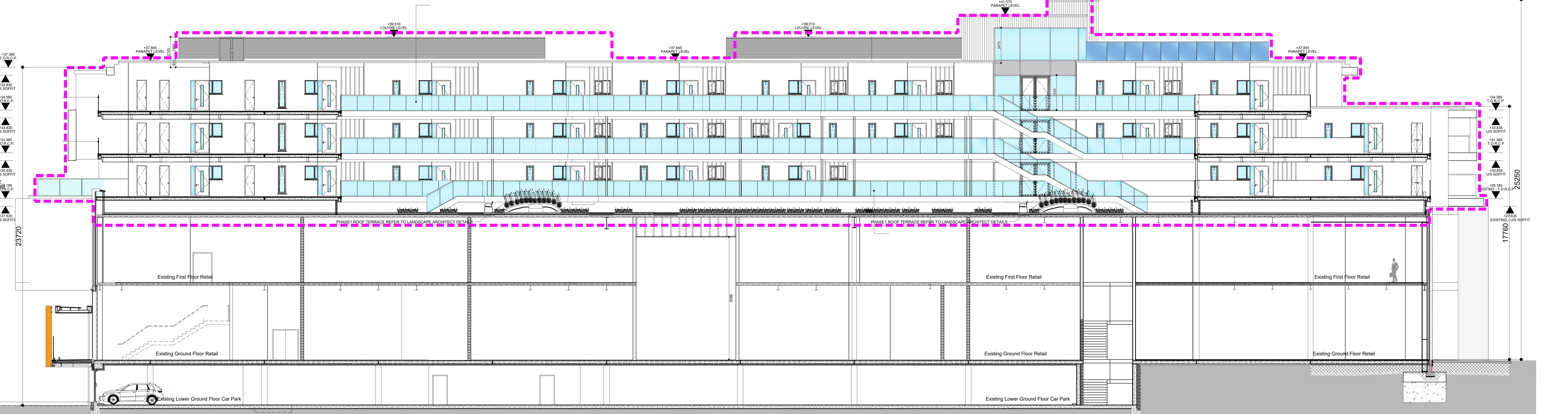
04 2144 PROPOSED BLOCK B SOUTH WEST ELEVATION PHASE 1 A0 @ SCALE: 1:100